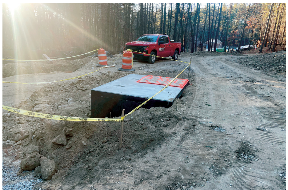
Foundation and piping work is underway in South Acton (left) while the meter vault for the bedrock wells in Acton Center (right) awaits electrical and piping connections to be made.